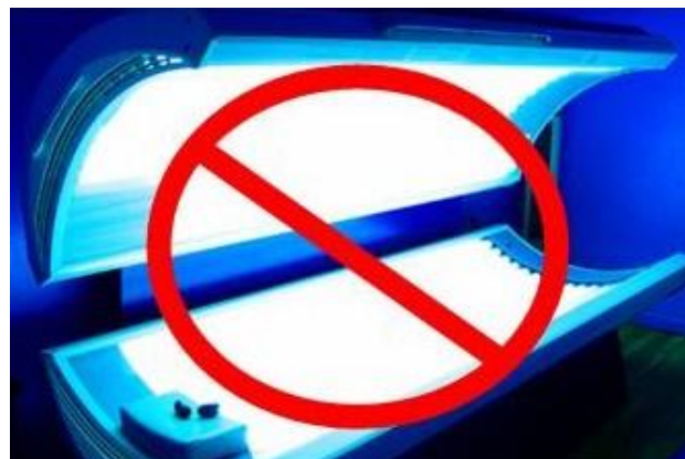
Image Citation: The University of Arizona Cancer Center. "Dangers of Tanning Beds." http://uacc.arizona.edu/sci/skin-cancer-prevention/tanning-bed-danger .